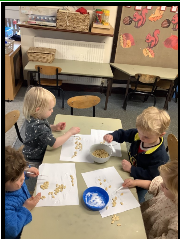
Creating pictures with pumpkin seeds.