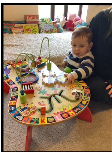
Exploring the activity table.