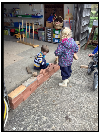
Constructing a wall together.