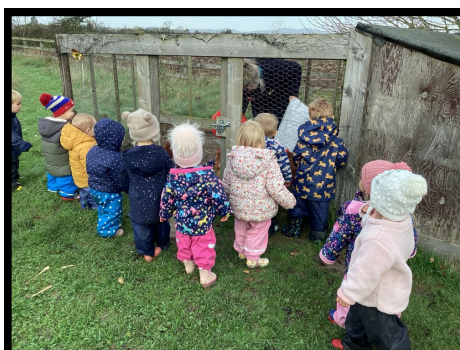
Feeding the chickens.