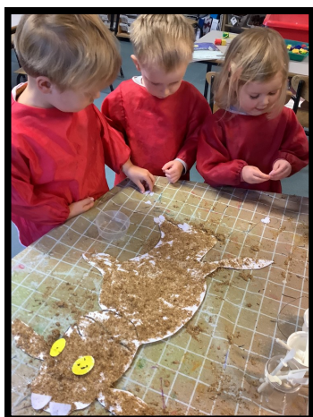
Creating the Gruffalo child.