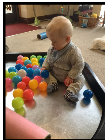
Ball and tube fun.