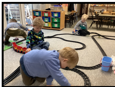
Having fun with our new train track.