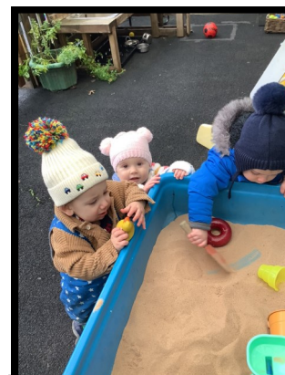
Exploring the sand.