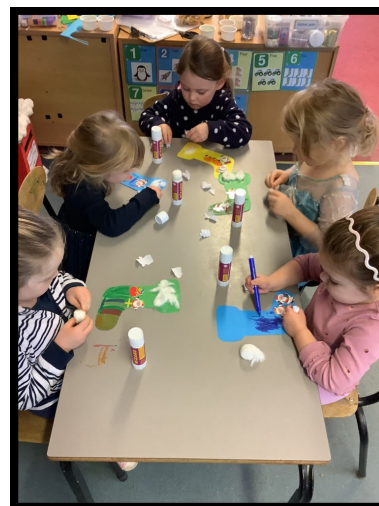
Enjoying Christmas craft.