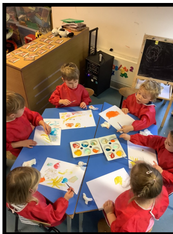
Painting with the fine brushes.