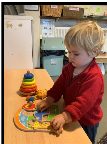
Having a go at completing the animal insert puzzle.