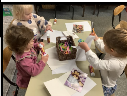
Cutting and sticking.