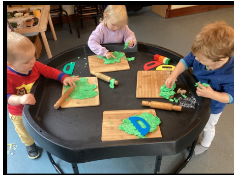
Using a variety of tools to explore the play dough.