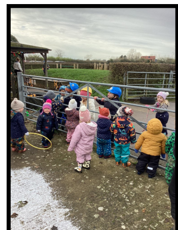
Visiting our Big squirrel friends.