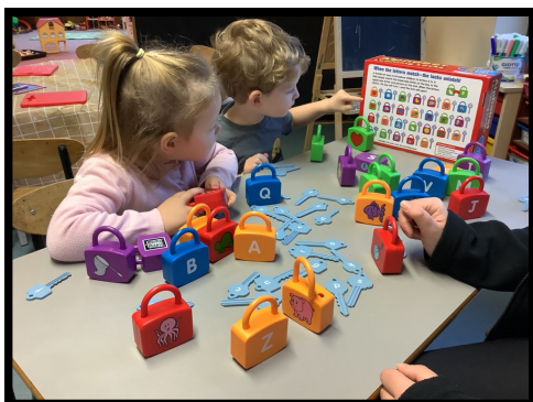
Looking at the alphabet learning blocks.