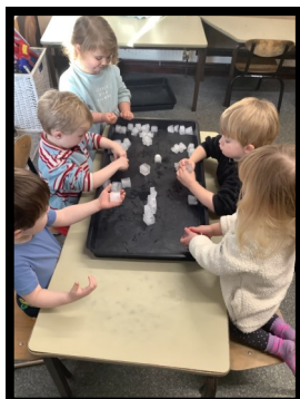
Exploring the ice sensory tray.