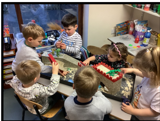
Exploring the Dragon sensory tray.