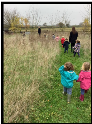
A walk through the meadow to look for the Gruffalo.