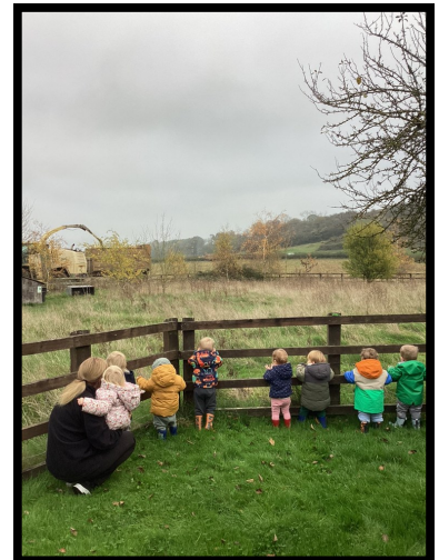
Watching the Maize being harvested.