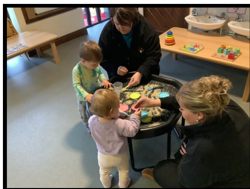
Filling and emptying pots.