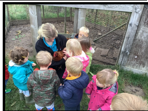
Checking our chickens and collecting the eggs.