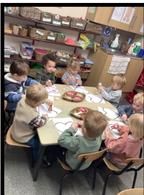
Creating our hearts.