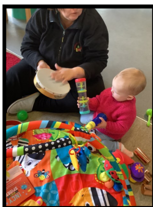
Having fun with the musical instruments.