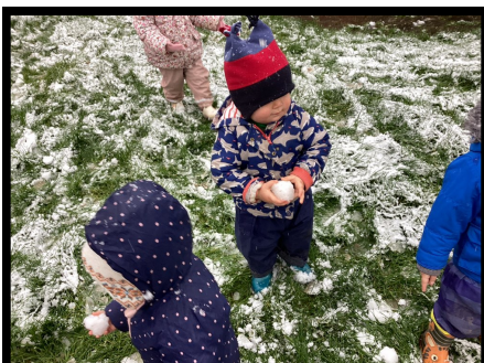
Exploring the snow.