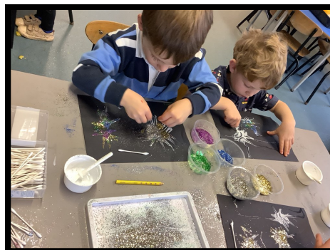
Creating firework pictures.