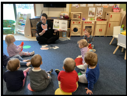
Joining in the interactive story time.