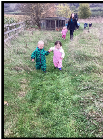
Enjoying a walk in the meadow.