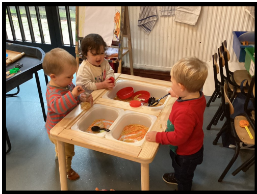
Sensory tray fun.