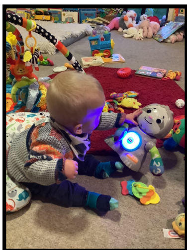
Exploring the ICT toys.