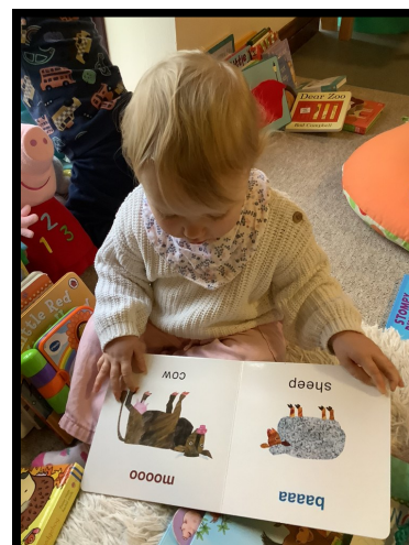
Enjoying a book.