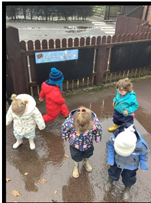
Splashing in puddles.