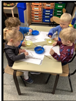
Using lots of sticky glue to create our stick men.