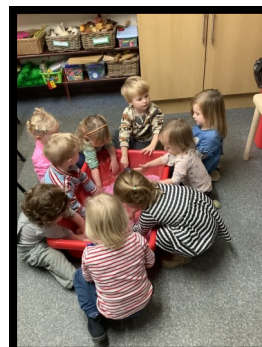
Exploring the jelly bath mixture.