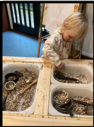
Gruffalo Crumble sensory tray.