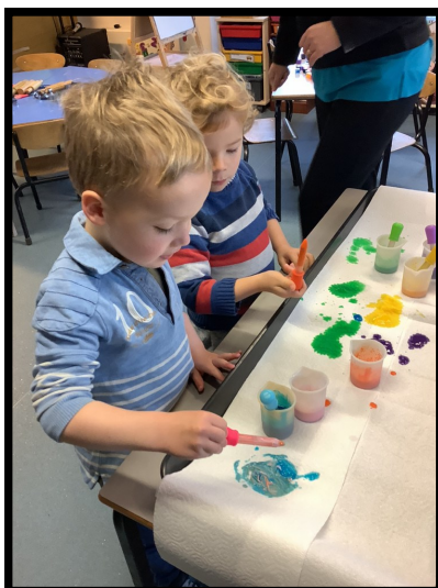
Exploring with colours.