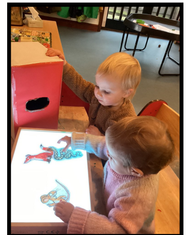
Exploring the light box and post box.