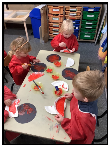
Creating our Ladybirds.