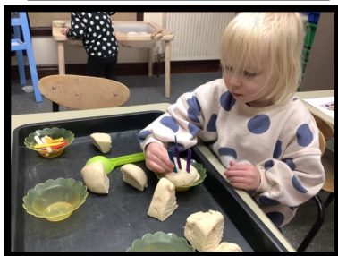
Creating cakes out of the dough.