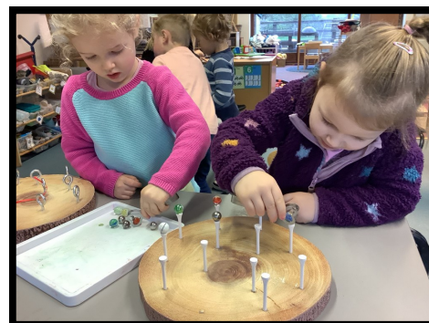
Balancing the marbles using tongs.