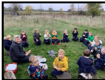
Enjoying a hotdog in the meadow.