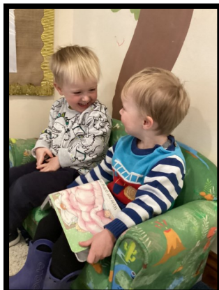
Enjoying a book with friends.