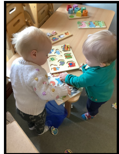
Having a go at the puzzles together.