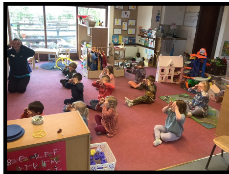
Playing I Spy