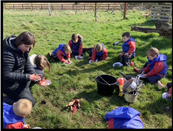
Creating a mud mummy in the meadow!