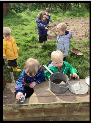
Exploring the Mud Kitchen