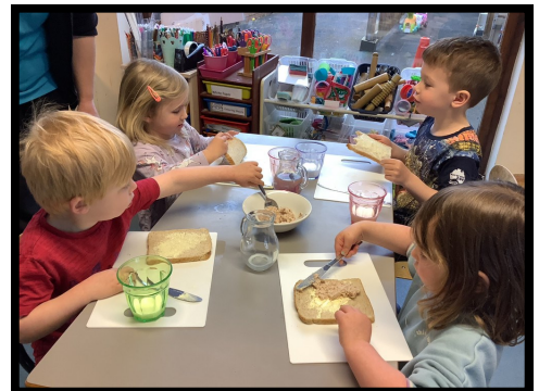
Making our own sandwiches.