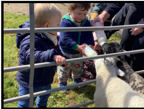
Feeding the lambs.