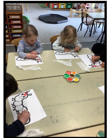
Painting our Caterpillars.