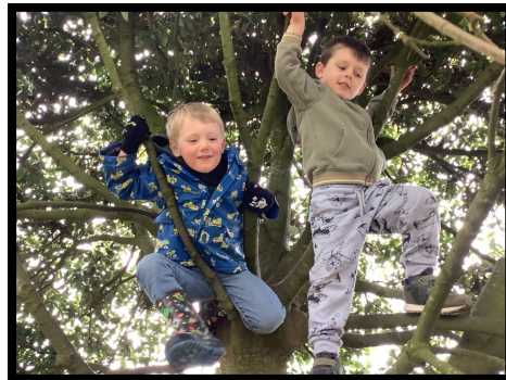
Fun in the climbing tree.