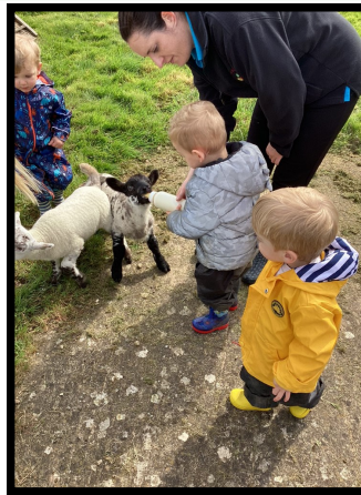
Bottle feeding the lambs.