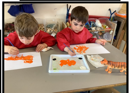
Creating some impressive Tigers.