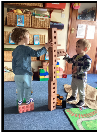
Building structures together.