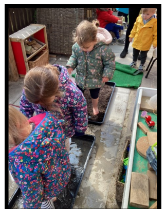
We're going on a sensory walk!