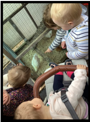
Visiting the chicks.