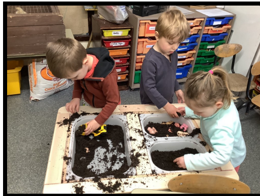
Exploring the sensory tray.