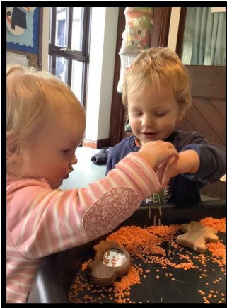
Exploring the sensory tray together.