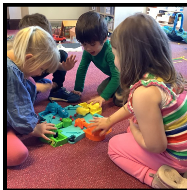
Playing games together.