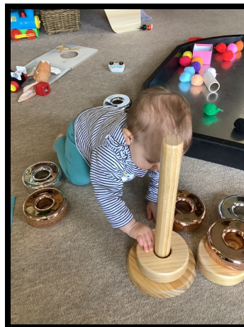
Exploring the sensory stacking rings.