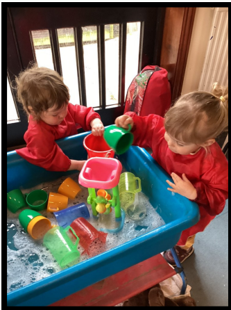
Water tray fun.