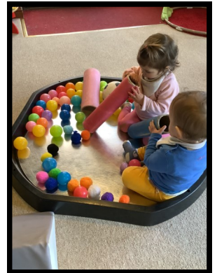
Fun with balls and tubes.