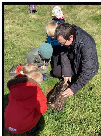
Looking for mini beasts.