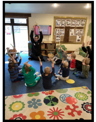
Creating music with Tapper sticks