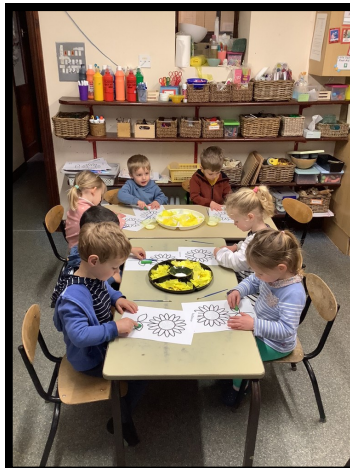
Creating our Sun flower pictures.