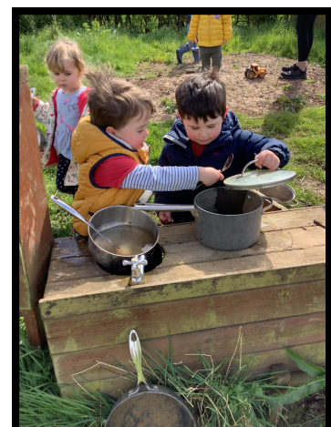
Making some tasty soup!