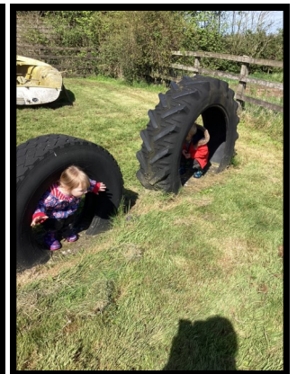
Playing hide and seek.