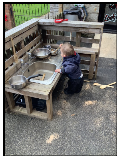
Exploring the outside kitchen.