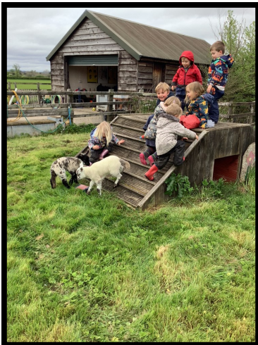
Having fun with the Nursery lambs.