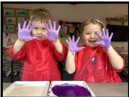
Creating the colour purple.