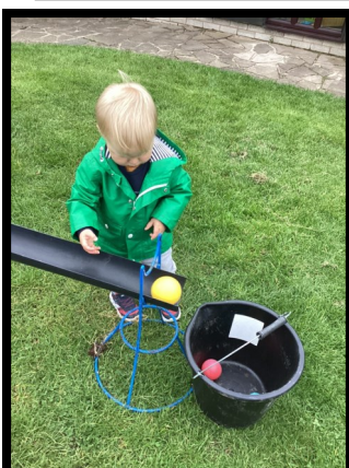
Fun with balls and gut-tering.