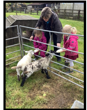
Feeding the lambs.