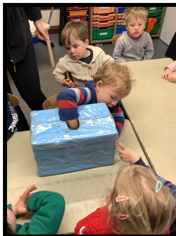
Playing, What's in the box!