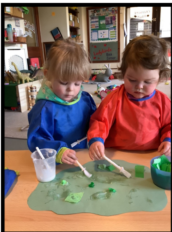
Lots of sticky glue!