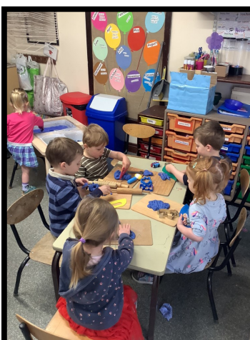
Rolling and cutting the blue dough.