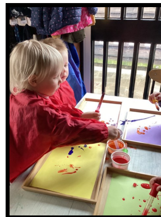
Painting using the pipettes.