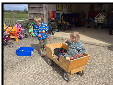
Having great fun together.