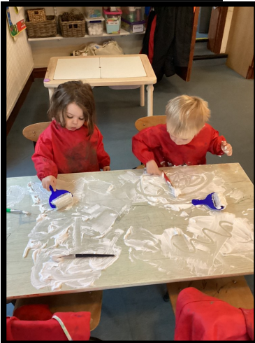
Mark making in the foam.