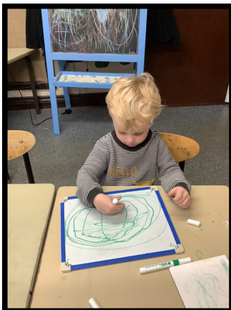
Exploring mark making.