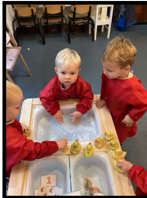
Fun in the five little ducks sensory tray.