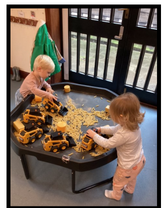
Using the diggers to scoop up the pasta.