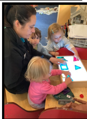
Exploring shapes and colours on the light box.