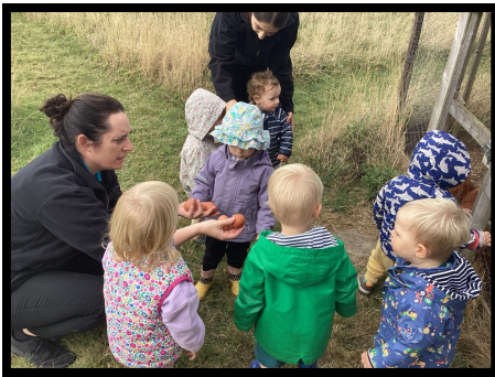
Collecting the eggs.