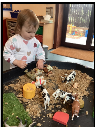
Enjoying the farm sensory tray.