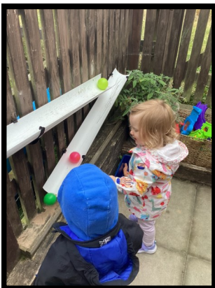
Rolling the balls down the pipes.