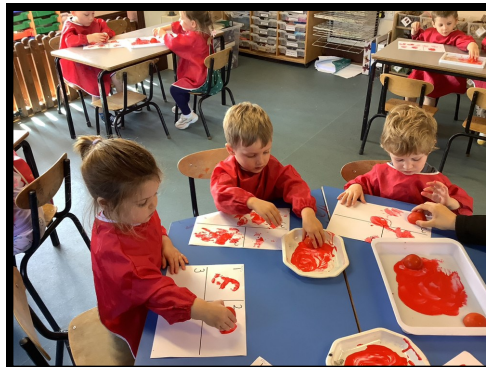
Printing with tomatoes.