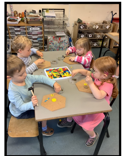
Creating patterns with the Tappa shapes.