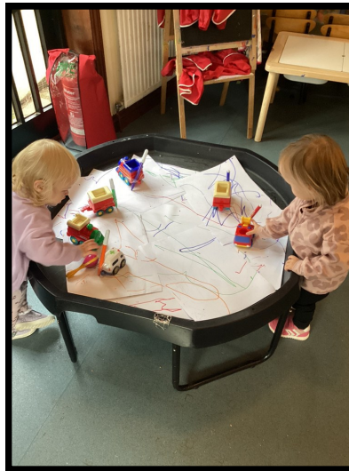
Having fun making marks.