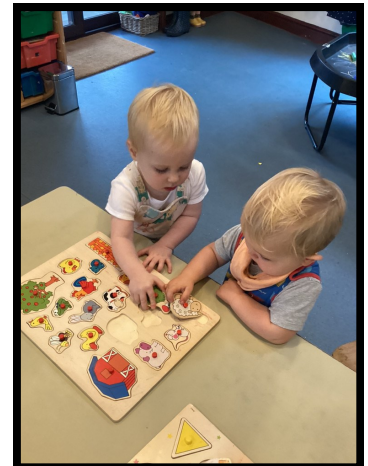
Completing the insert puzzle together.