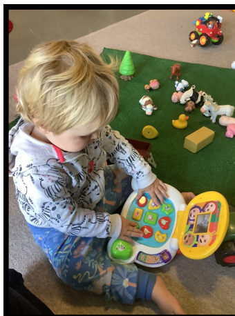
Exploring the ICT toys.