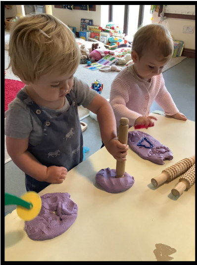
Exploring the playdough.