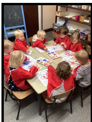
Using small brushes and paints to create our colourful pictures.