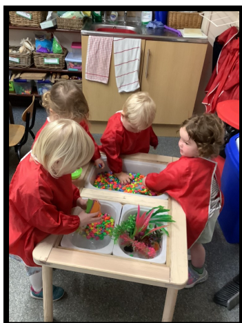
Exploring the sensory tray.