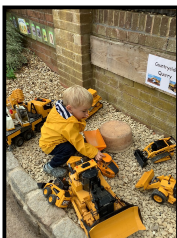
Using the small world diggers to scoop the stones up.