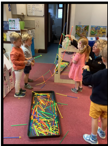
Building a ladder together.