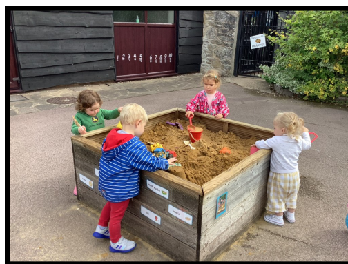
Making sand castles.