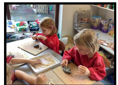
Creating our clay Hedgehogs.