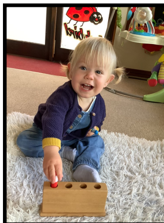
Having fun with sorting pop up.