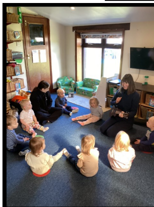
Ukulele led music time.