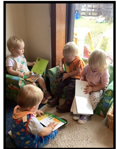
Enjoying looking at the books.