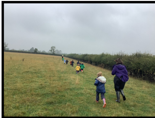
Going for a morning run in the field.