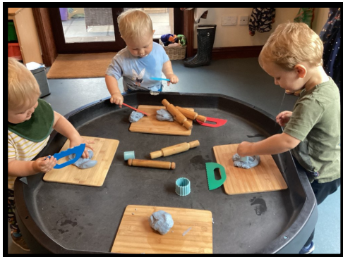
Exploring the playdough.