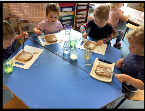
Preparing our sandwiches for snack.