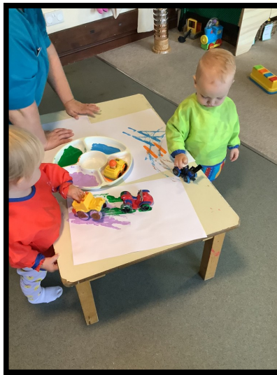
Mark making with the vehicle's.