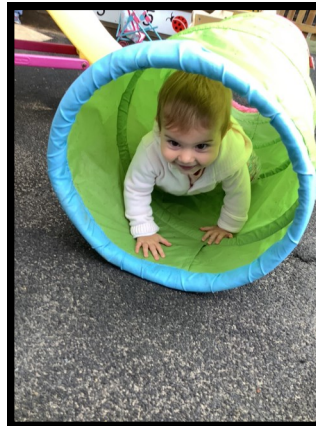
Fun in the tunnel.