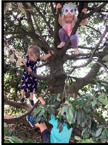
Exploring the climbing tree.