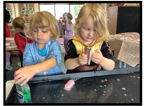
Practising washing our hands.