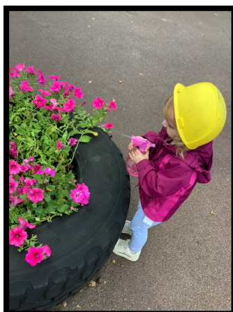
Giving our flowers a little spray of water.