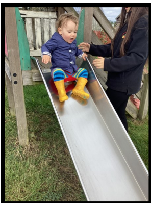
Ready, steady, go!