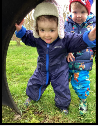
Enjoying playing in the meadow together.