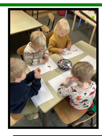
Creating pictures with Christmas stickers.