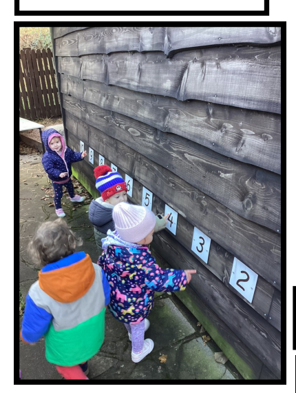
Showing an interest in numbers.