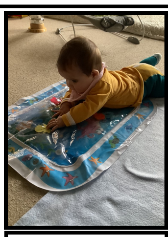
Exploring the Aqua mat.