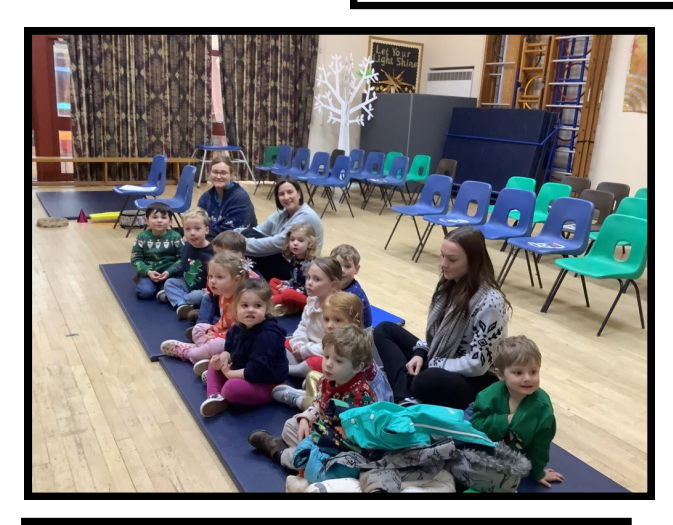
Waiting for Staunton Schools Nativity to start.