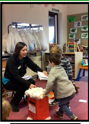
Delivering our Christmas cards.