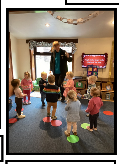
Music and movement time.