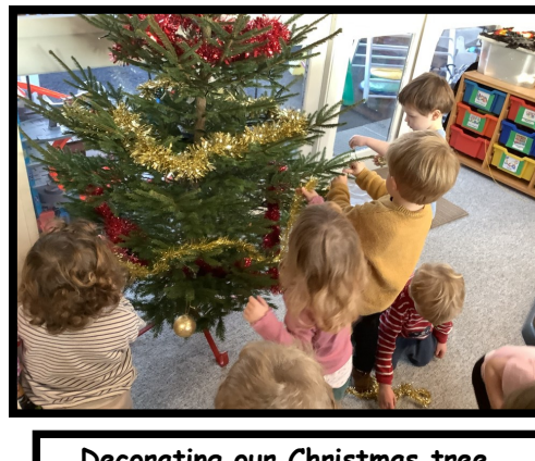
Decorating our Christmas tree.