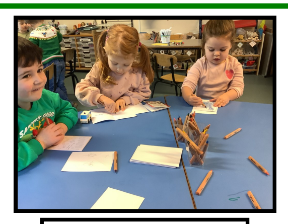
Colouring in Christmas cards.