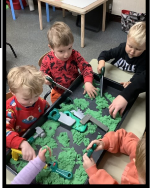
Exploring the kinetic sand sensory tray with tools.