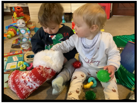
Exploring what's inside the Christmas stocking.