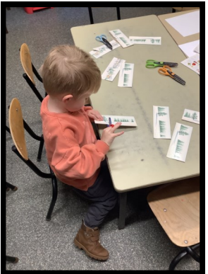
Practising cutting skills.