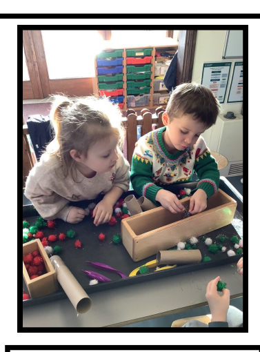
Exploring the Christmas sensory tray.