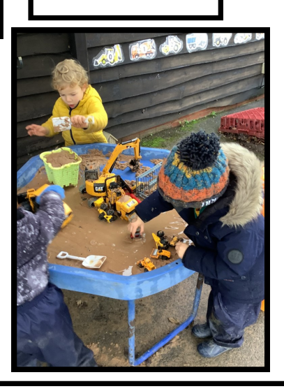
Digging and scooping.