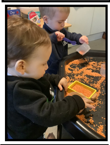
Emptying and filling the pots.