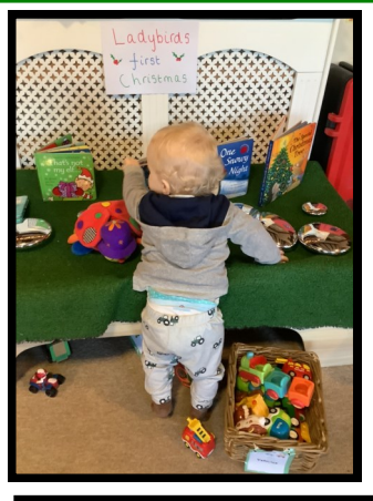
Exploring the Christmas interest table.