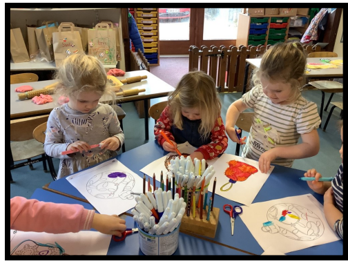
Colouring and cutting Christmas pictures.