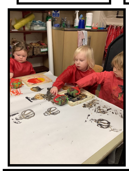
Using the rollers to create our group painting.