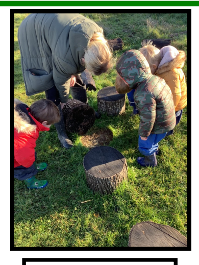
Looking for bugs.