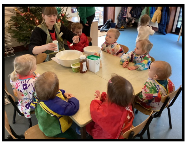
Making gingerbread people.