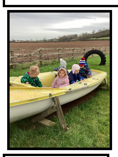
Having fun in the boat.