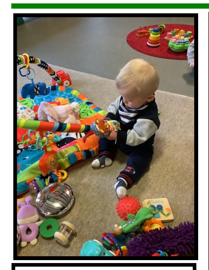
Showing an interest in the ICT toys.