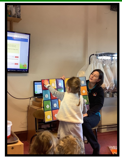
Opening our Advent calendar.