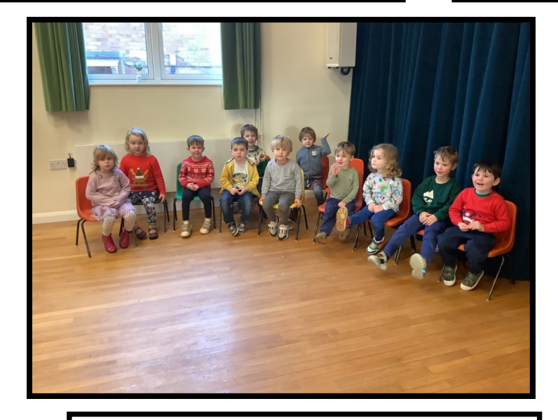
Ashleworth Schools Nativity