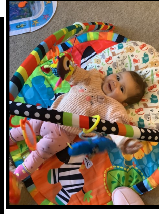
Having fun with the baby gym.