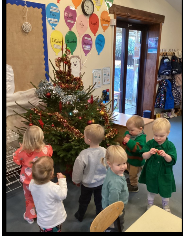
Decorating our Christmas tree.