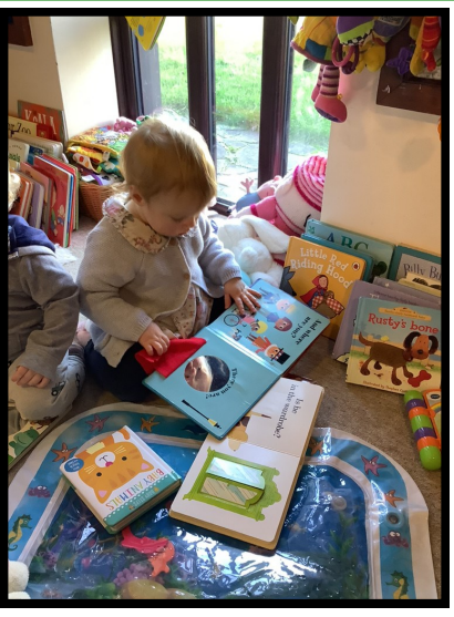
Enjoying looking at a book.