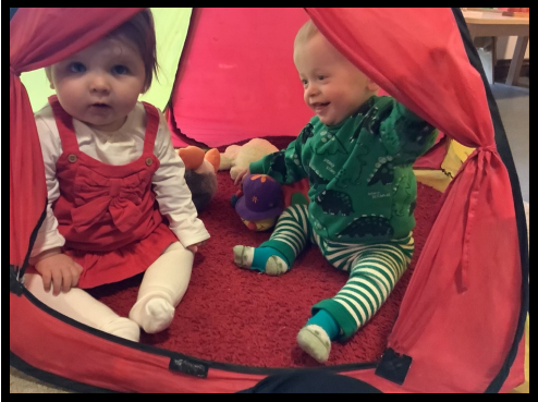
Having fun together in the tent.