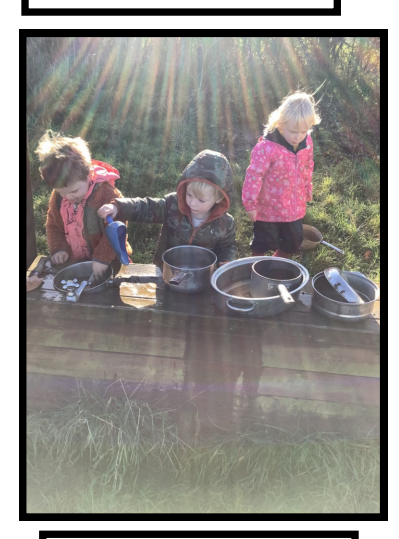
Cooking up some treats in the mud kitchen.