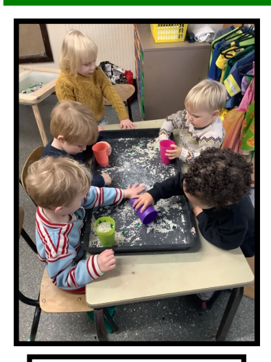
Rice sensory tray fun.