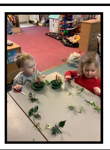
Creating our Christmas table decorations.