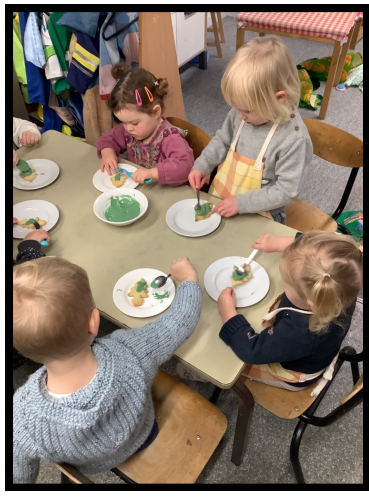
Decorating Christmas biscuits.