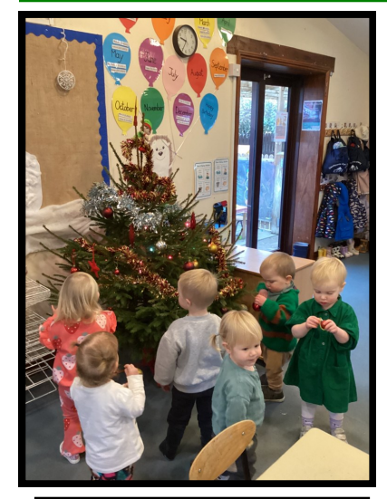
Decorating our Christmas tree.