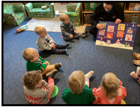
Opening our Advent calendar.