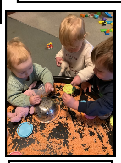
Having fun threading the spaghetti into the colander.