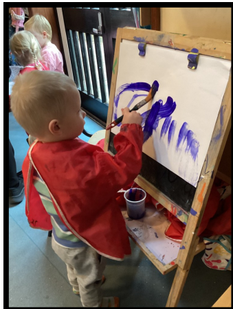
Getting creative with the paint.