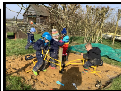
Diggers in the large sandpit.