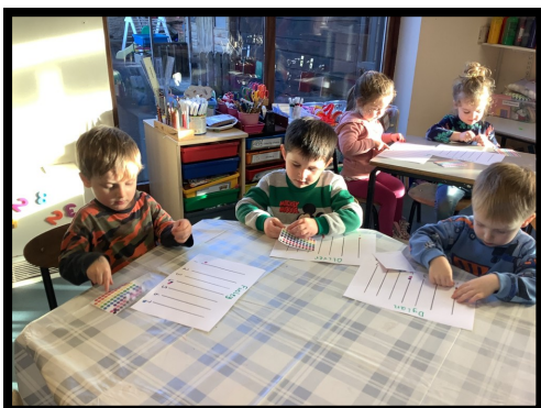
Completing our number 7 sticker challenge.