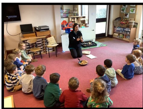
Having fun with number songs.