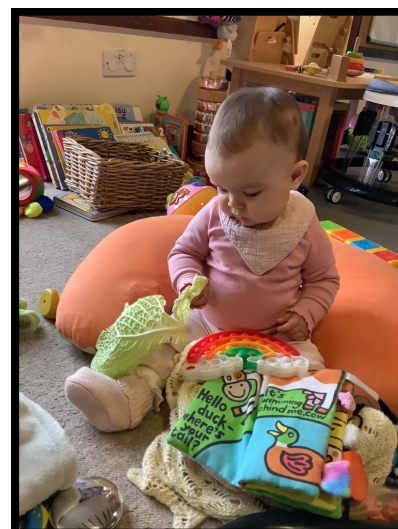
Exploring different textures.