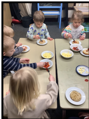
Making some delicious pizzas.