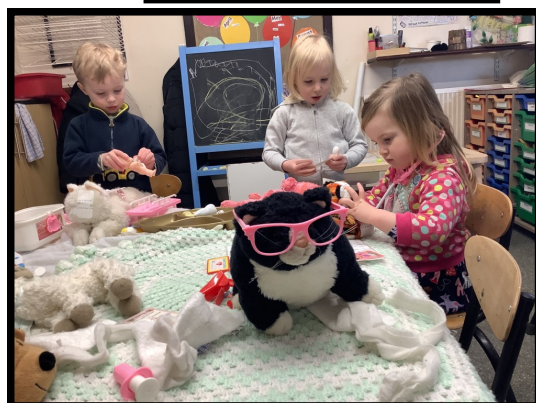
Vet role play.