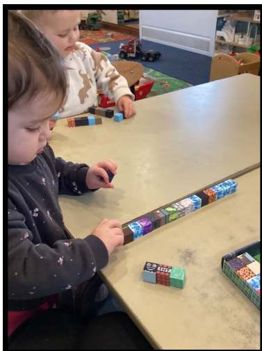
Practising our fine motor skills.