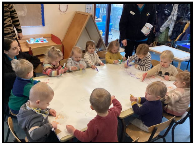
Exploring mark making together.