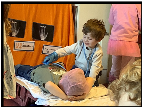
Doctors role play.