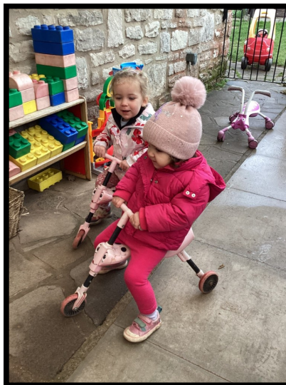
Scooting along on the trikes.