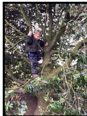
Fun in the climbing tree.