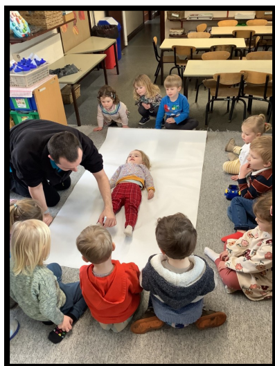
Looking at our bodies by drawing around them.