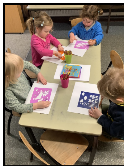
Mark making using stencils.