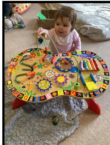
Having fun with the activity table.