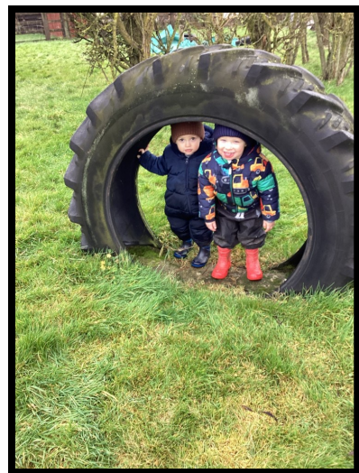
Having fun together in the large Tractor tyres.