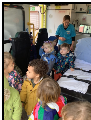
Having a look inside an Ambulance.