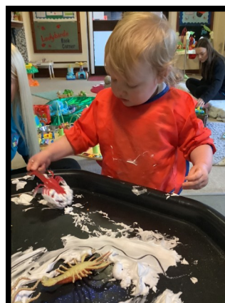
Exploring the Sea Life sensory tray.