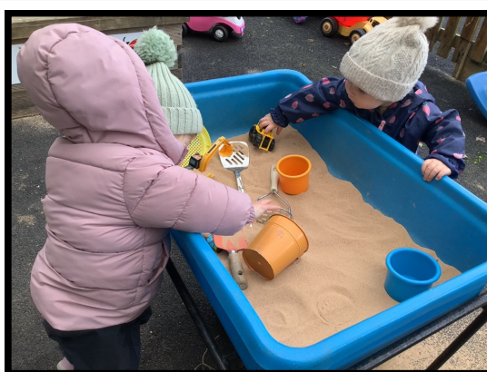
Enjoying playing in the sand tray outside.