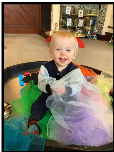
Sensory tray fun.