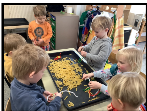
Practising our threading skills.