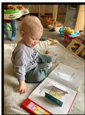
Enjoying looking at a book.