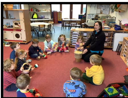
Rhythm and rhyme time.