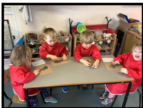
Creating number 9 with the clay.