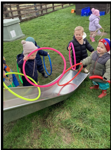
Having fun with the large hoops.