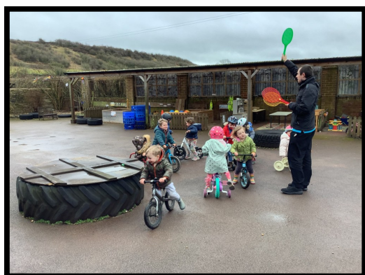
Riding our bikes and scooters in the play