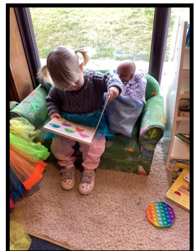
Enjoying a book.