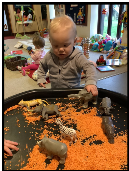
Exploring the lentil and wild animal sensory tray.