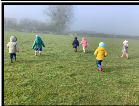
Going for a walk in the fog.