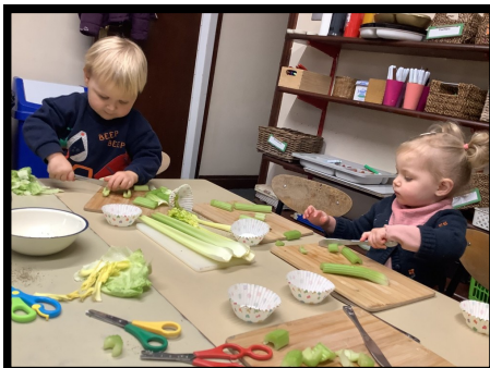
Chopping and snipping our vegetables.