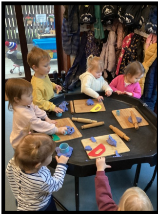
Rolling and squashing the play dough.