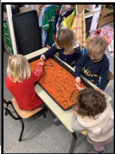
Making marks in the rice.