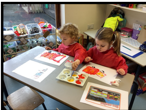
Creating Fire Engine pictures.