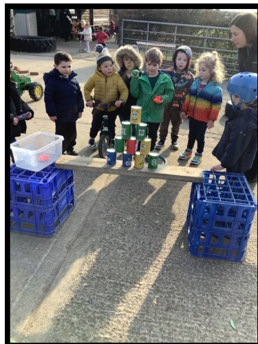
Playing Tin Can Alley together.