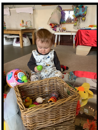
Treasure Basket time.